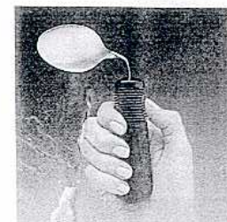
3. Adapted for custom use.