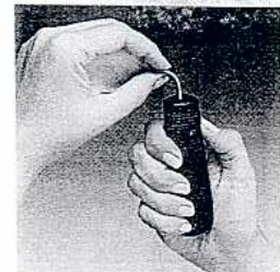
2. Bend at the twist, either right or left.