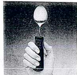
1. Hold the handle firmly.