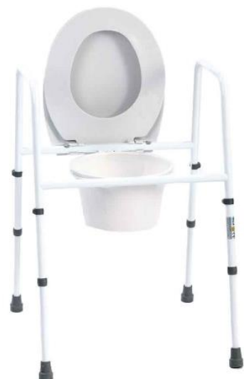
Figure 3 – M11090 with Commode Pan M20303 fitted

Please visit our website or contact Customer Services for more details.