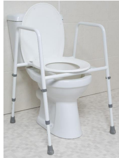
Figure 1 – M11090