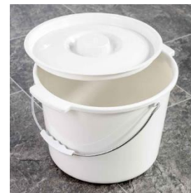
Figure 2 – M20303 Commode Pan

Please visit our website or contact Customer Services for more details.