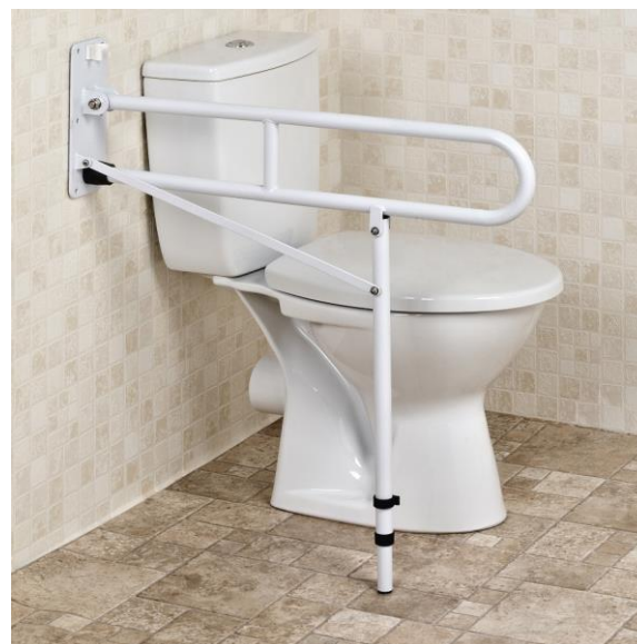
Figure 1 – M48465 In Use

Please Note: As the mounting substrate can vary considerably, we do not supply fixings. Please ensure the chosen fixings are fit for purpose and are compatible with both the product and the mounting substrate. If in doubt, please contact a suitably qualified person.