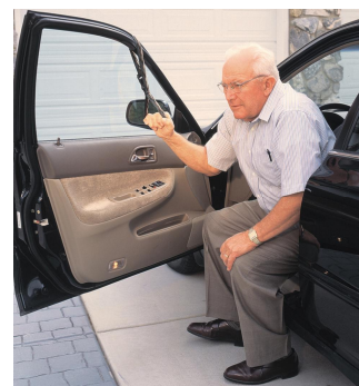
Car Caddie M15393