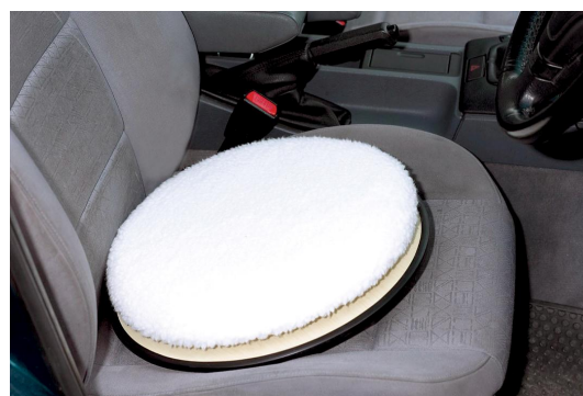
Swivel Seat Deluxe L33996

These products are included in our range of over 3000 daily living aids available from NRS Healthcare.