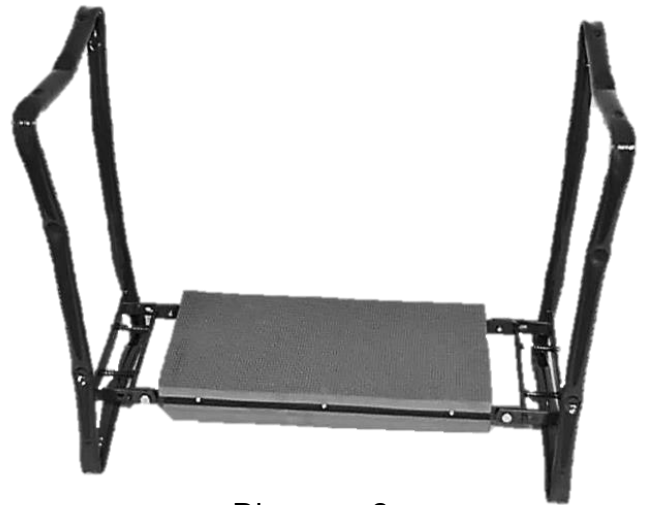
Diagram: 2 Kneeler Option