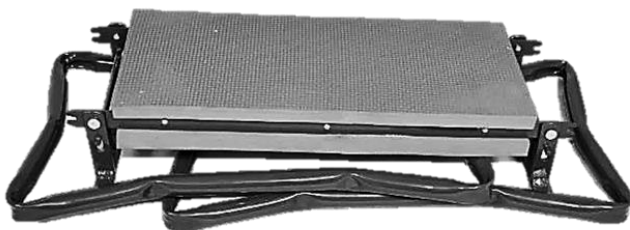
Diagram:1 Product Folded

Product is delivered folded, Instructions for assembly are shown overleaf.