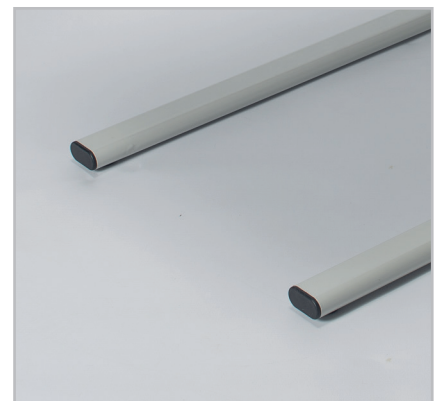
Mushroom feet fitted