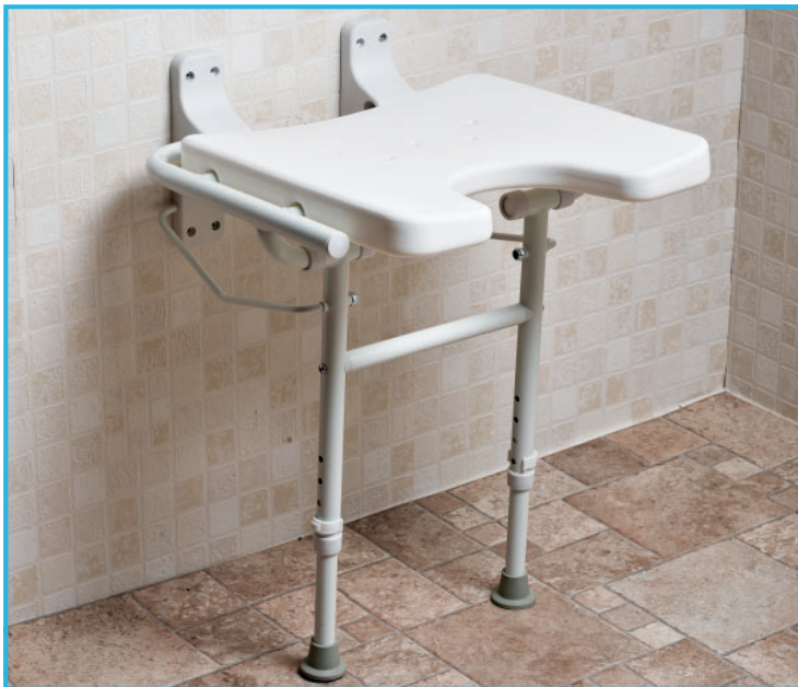
Figure 1: Shower Seat (in use)

This Shower seat is intended to be used in a bathroom or shower, to provide a stable seated surface for clients with reduced mobility who are unable to stand during showering. It can be folded up against the wall when not in use.