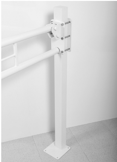
Floor mounting post