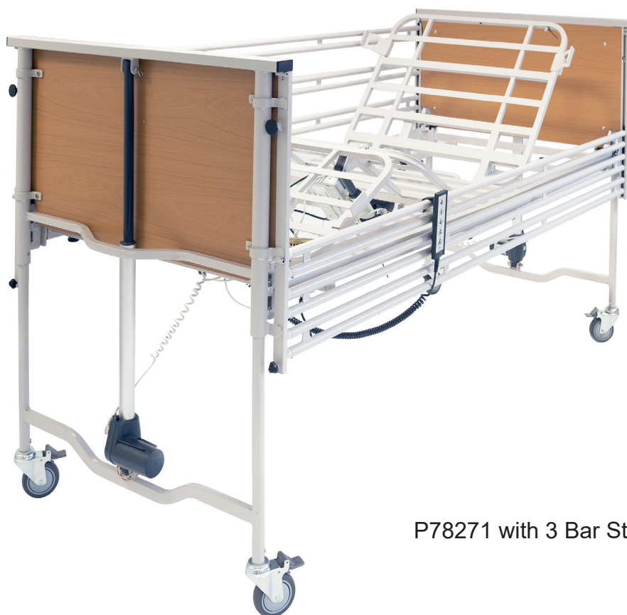
P78271 with 3 Bar Steel Side Rails