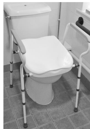
Figure 2 – Seat Lid Closed