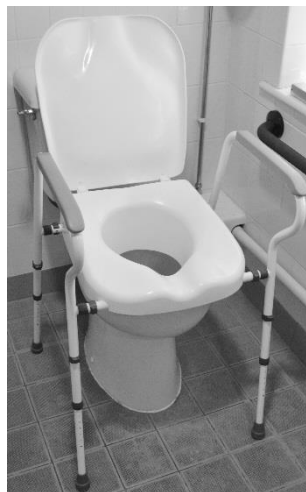
Figure 1 – Seat Lid Open