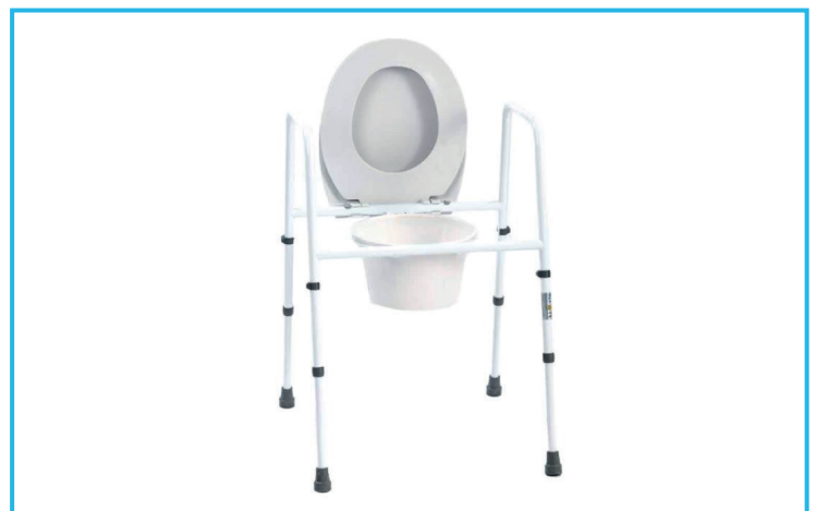
Figure 3: M11090 with Commode Pan (M20303) fitted

Lift the seat and lid to slot the commode pan into position on the frame, see figure 3.