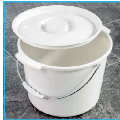
Figure 2: M20303 Commode Pan

Lift the seat and lid to slot the commode pan into position on the frame, see figure 3.