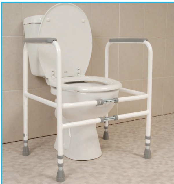
Figure 2: M00870