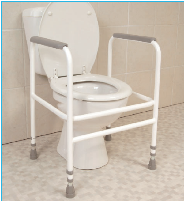
Figure 1: M00869