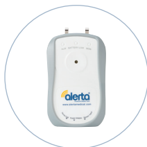
Alerta Alarm Monitor