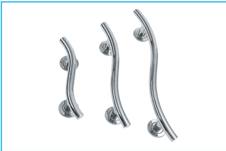
Figure 1: Curved Rails

The SPA Grab Rail range provides a stable support to assist users to raise and lower themselves, and provides stability when overcoming everyday obstacles.