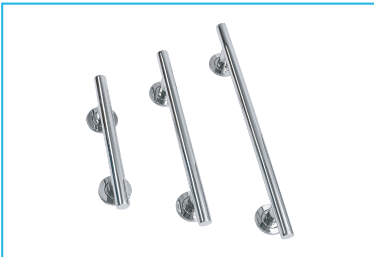
Figure 2: Straight Rails