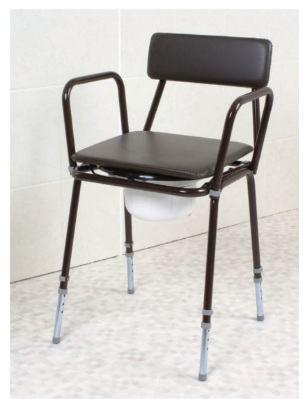
F18864 Adjustable Height

Please ensure these instructions are fully read and implemented. Failure to do so may result in injury to the user. Retain in a safe place for future reference.