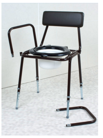
F19455 Adjustable Height & Detachable Arms