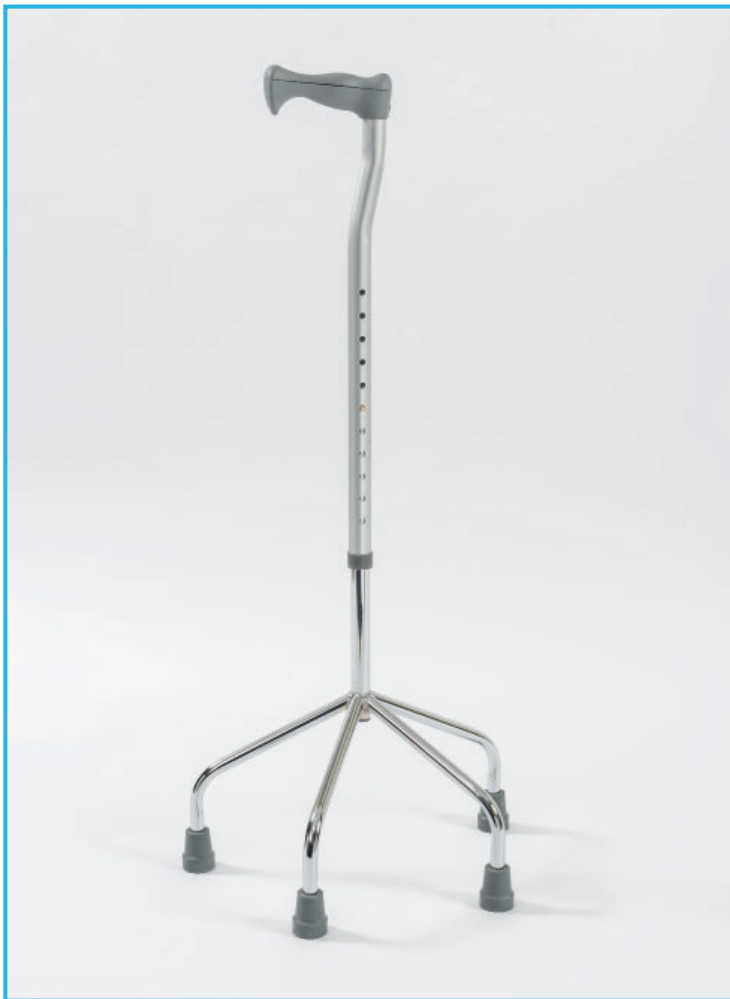
Figure 1: Tetrapod Walking Stick Large Base

Tripods and Tetrapods are walking aids with 3 or more legs designed to give the user greater stability and support than a single stick.