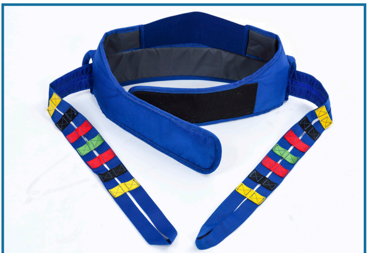
Safety Belt available in three sizes - colour coded loops