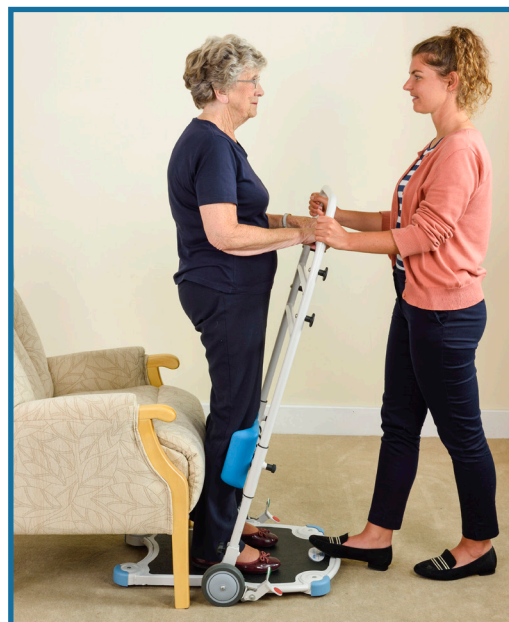
User is ready to transfer