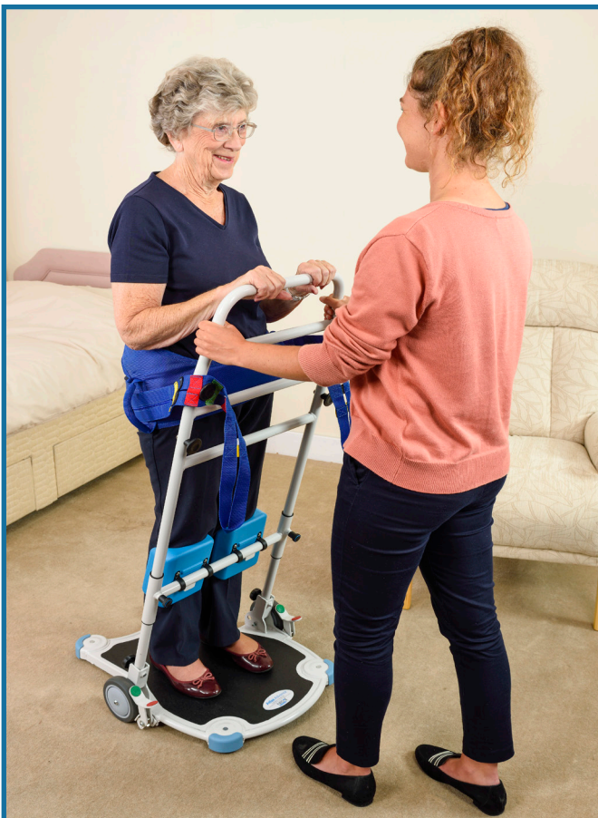
Secure transfers using Safety Belt