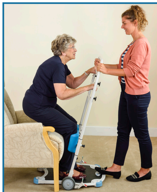
User has a choice of hand hold positions