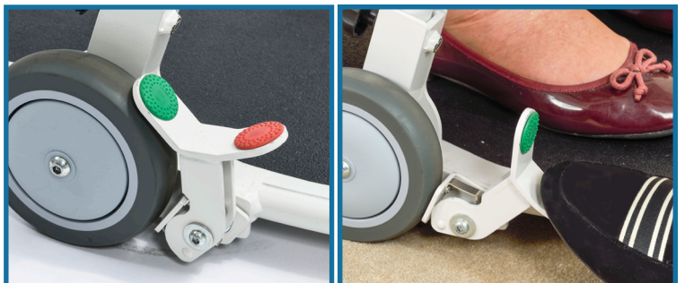
Twin linked brake levers