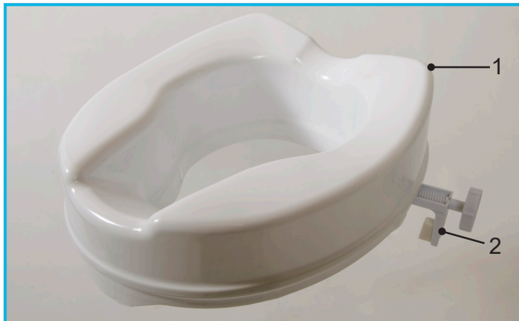
Figure 1: Raised Toilet Seat Assembly

If damage is found, stop using the seat and contact your supplier immediately for advice.