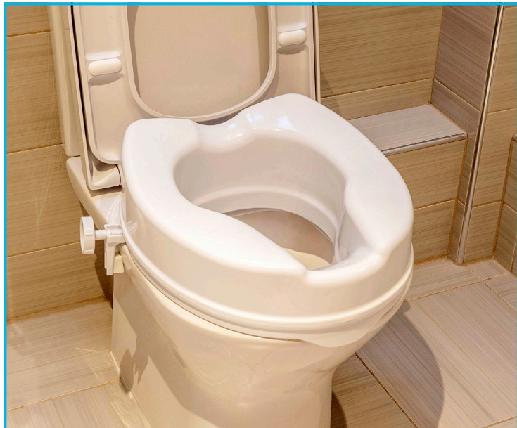
Figure 3: Seat Position