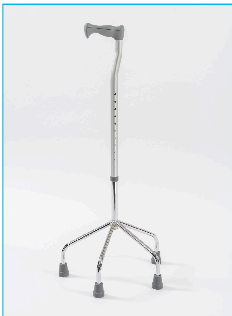
Figure 1: Tetrapod Walking Stick Large Base

Tripods and Tetrapods are walking aids with 3 or more legs designed to give the user greater stability and support than a single stick.