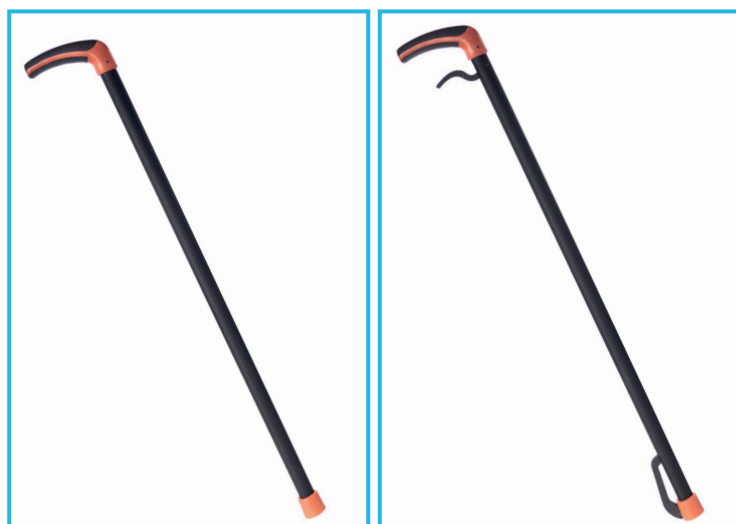
Freestyle Walking Stick

To enable comfort and support while walking or manoeuvring from one place to another. The Grab & Go Walking Stick has the additional benefit of the grabber feature to enable the retrieval of light to mid-weight items, such as keys, wallets and glasses.