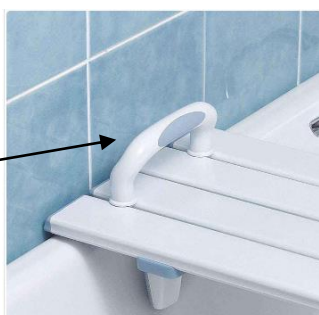
L71274 – Nuvo™ Grab Handle Handle angled inwards

Turn the board upside down and tightly fasten the screws using the allen key provided.