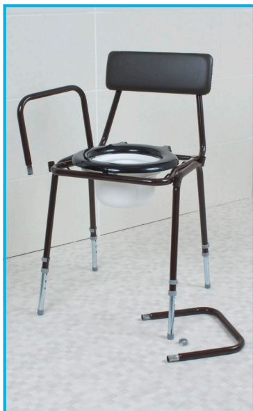
F19455 Adjustable Height Detachable Arms