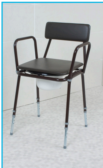
F18864 Adjustable Height Fixed Arms

The Dovedale commode range has been designed to assist those who have difficulty in accessing or using a standard toilet. All Dovedale commodes have a hinged plastic toilet seat, commode pan with lid and vinyl lift off vanity cover.