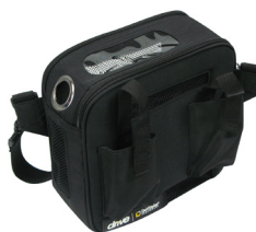
Carrying Case 125D-670