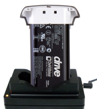
iGo2 Charging Station (Battery not included) 125CH-615