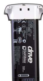
Rechargeable Battery 125D-613