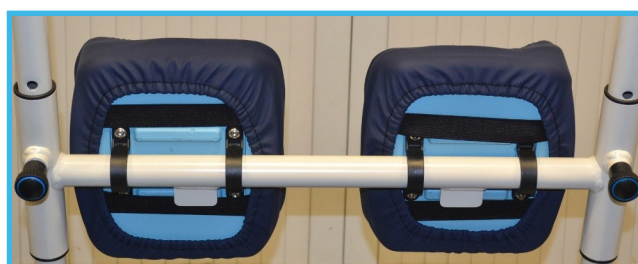
Fig. 7 'Back View'