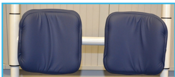
Fig. 6 'Front View'