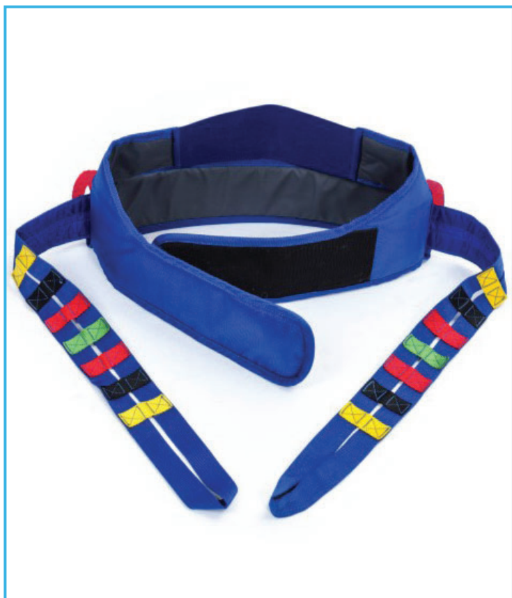
Atlas Advance Safety Belt

The transfer aid safety belt is designed to provide support to the user of the Atlas Advance Transfer Aid over short distance transfers. It may also be used to assist the user rising from or lowering into a seated position, provided a suitable risk assessment is completed.