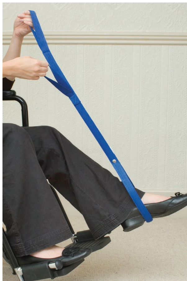
Figure 4 – Using the Double Loop Leg Lifter

NRS Healthcare is a leading supplier of community equipment and daily living aids. Please visit one of our websites to view our full range of products: www.healthcarepro.co.uk or www.completecareshop.co.uk