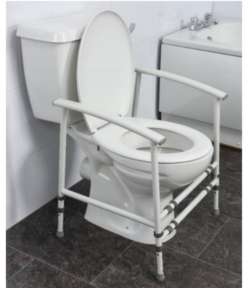
Figure 1 – Toilet Frame