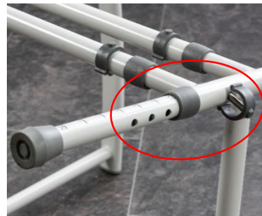
Figure 5 – Attaching the legs

Use the markings on the legs to ensure that all four legs are positioned at the same height to prevent rocking and instability.