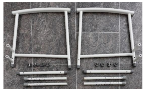
Figure 2 – Product Parts