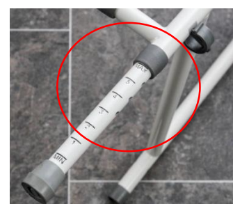
Figure 4 – Positioning the leg extensions