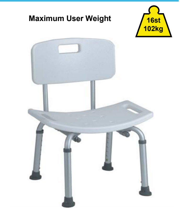
Figure 1 – L99792 Shower Chair

https://www.nrshealthcare.co.uk/bathroom-aids/shower-seats-shower-chairs/shower-stools/economy-shower-chair for an assembly demonstration.