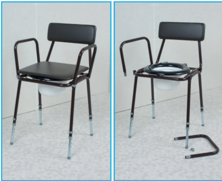
F18864 Adjustable Height Fixed Arms

The Dovedale commode range has been designed to assist those who have difficulty in accessing or using a standard toilet. All Dovedale commodes have a hinged plastic toilet seat, commode pan with lid and vinyl lift off vanity cover.