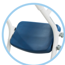
NEW! height adjustable leg pad