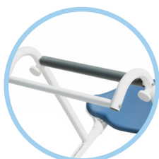
NEW! additional carer push bar