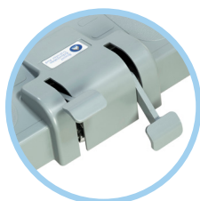
NEW! improved opening mechanism