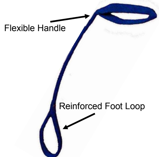
Figure 1 - F19571 Single Loop

Once your leg is in the desired position remove from your foot, repeat the process if necessary for your other leg.