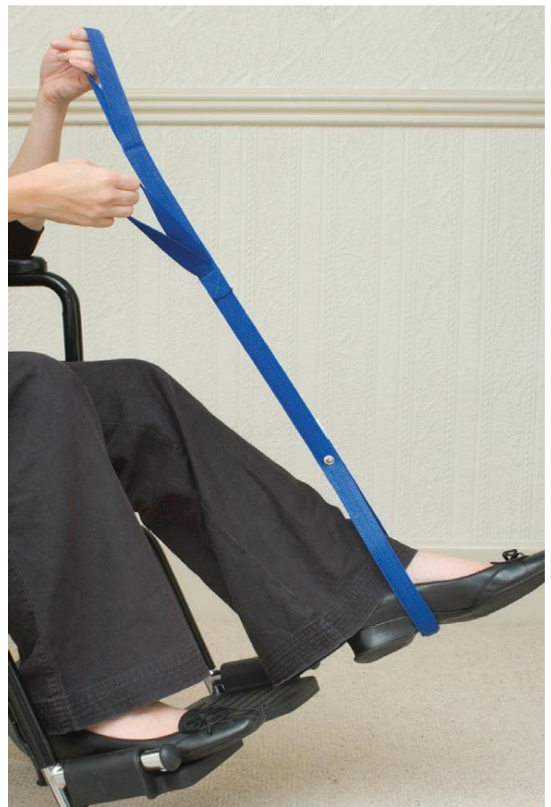
Figure 4 – Using the Double Loop Leg Lifter

NRS Healthcare is a Leading Supplier of Community Equipment and Daily Living Aids, to view our full range, visit our website: