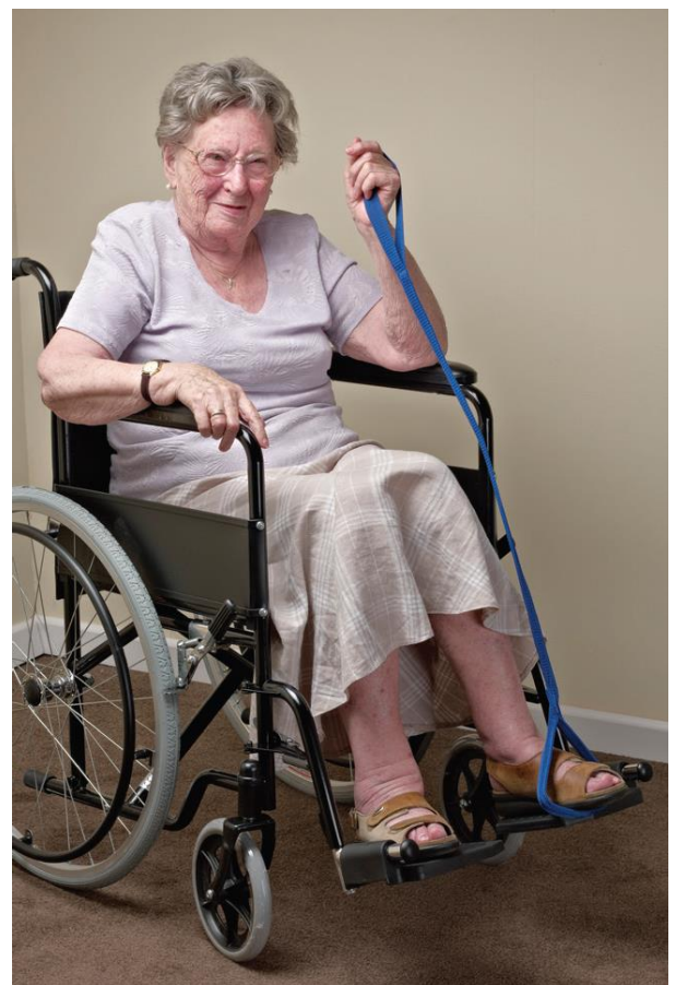
Figure 2 - Using the Single Loop Leg Lifter