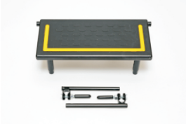
Assembly of parts of school chair footrest

The footrest is designed to clamp to the legs of standard school chairs. To assemble and fit to your chair you will need two 13mm spanners. (Not supplied.)