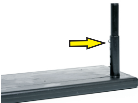
Button to adjust height of legs of footrest

Ensure the button has popped back fully through the hole, locking the leg at the selected height.