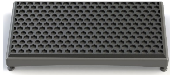
Figure 1 – Half Step

Turn the step upside down and use the spanner provided to tighten the locking nut and secure the feet at the required height, see figure 2.