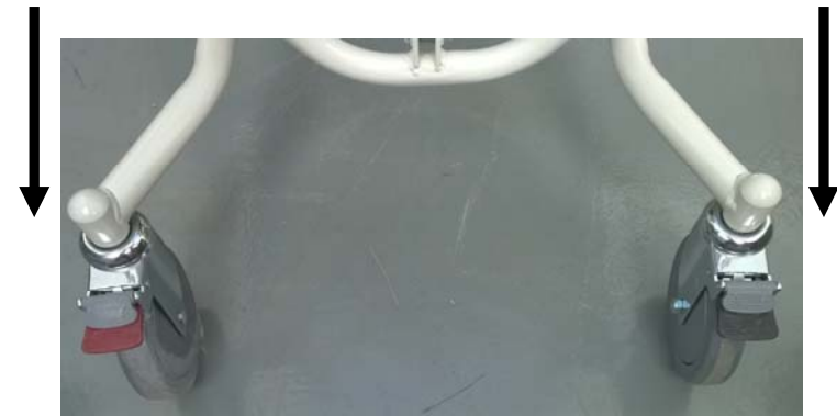
Directional Locking Caster