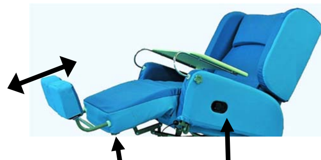
Adjust Length Hand Screw