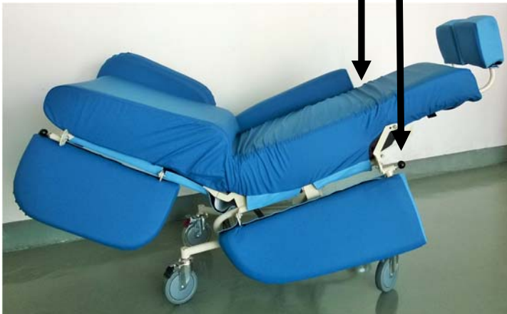
Arm Knob Releases