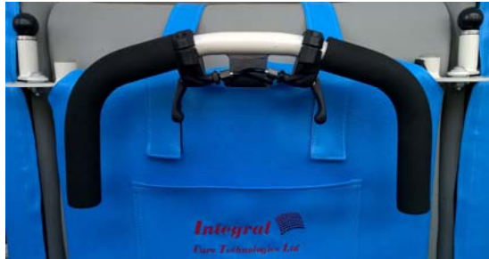
Right Knob Release