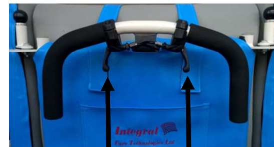
Adjust Seat Tilt