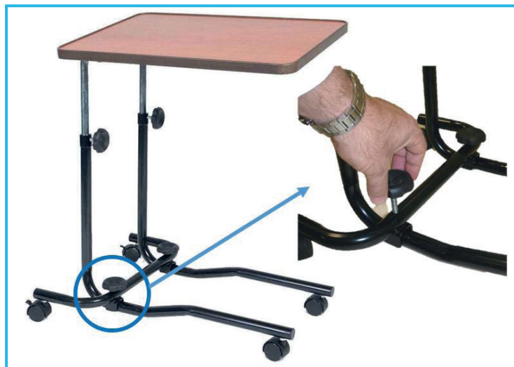
Figure 1: Assemble the Cross Brace