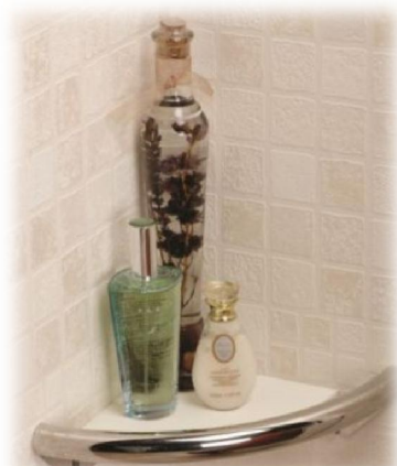
Corner Shelf Product Code: M66376