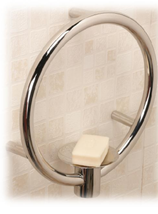
Soap Dish Product Code: M66388