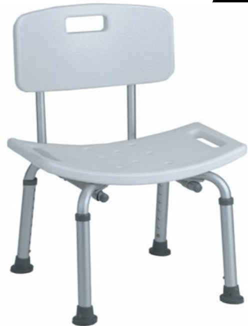
Figure 1 – L97792 Shower Chair