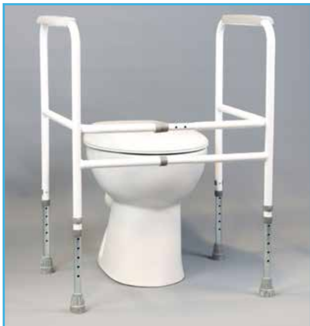
Figure 2: M00870