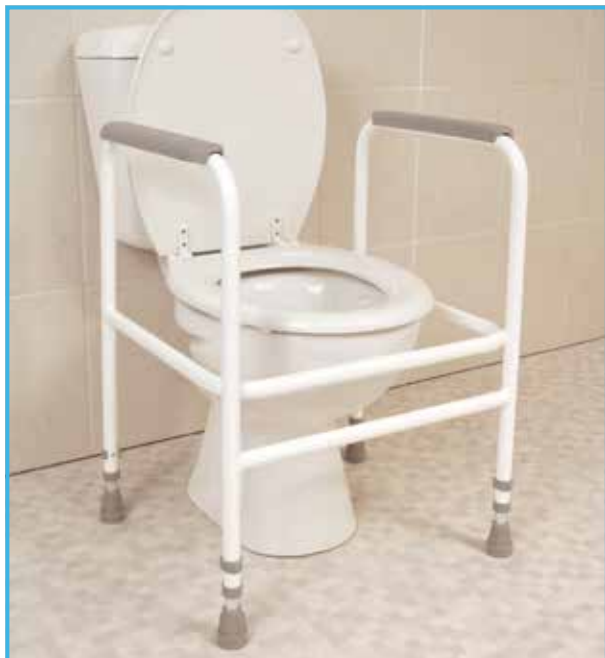
Figure 1: M00869